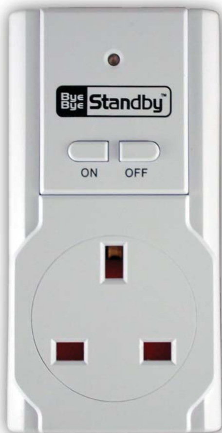
Bye Bye Standby Energy Saving Socket

Simply press and hold either the green or red (on or off) button on the remote control for the channel that you wish to use to control the socket. The LED will flash for a second and then remain switched off. The devices have now been successfully paired.